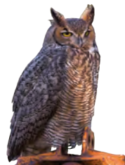
GREAT HORNED OWL Spotted by 4th graders in the Cypress Grove