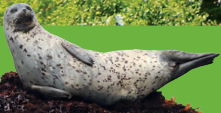
CALIFORNIA HARBOR SEAL Spotted by 3rd graders at Point Bonita